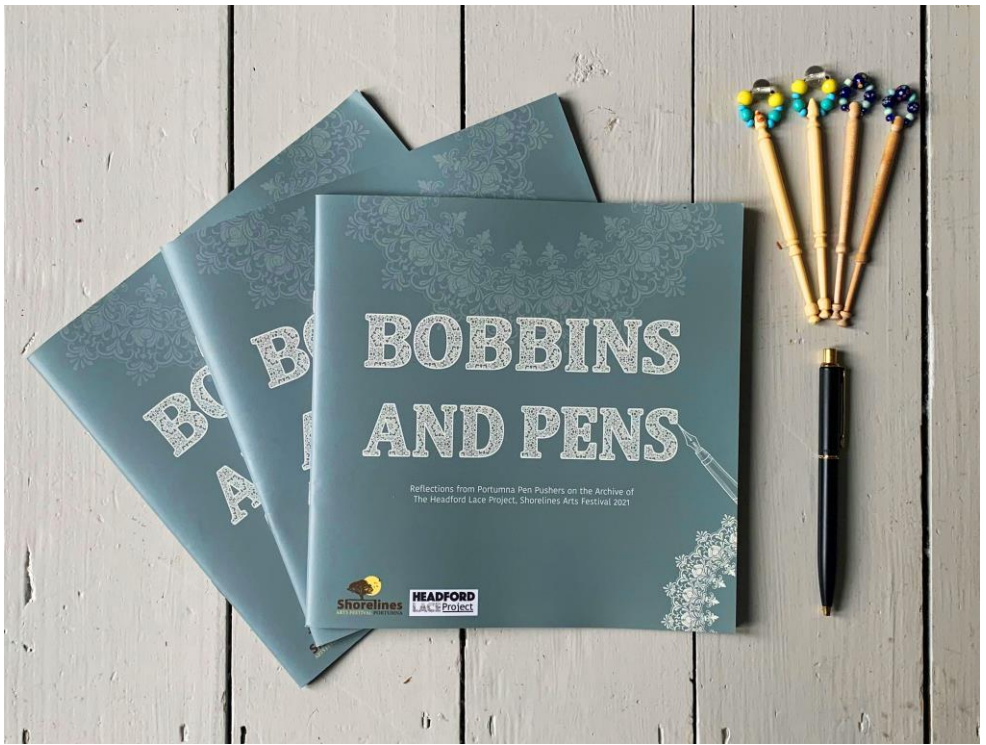
Bobbins and Pens Catalogue

"Feedback was very positive overall and people enjoyed both the workshop and the exhibition. Portumna Castle were thrilled to host the exhibition and have it's stay extended until November" Noelle Lynskey, Portumna Shorelines Festival