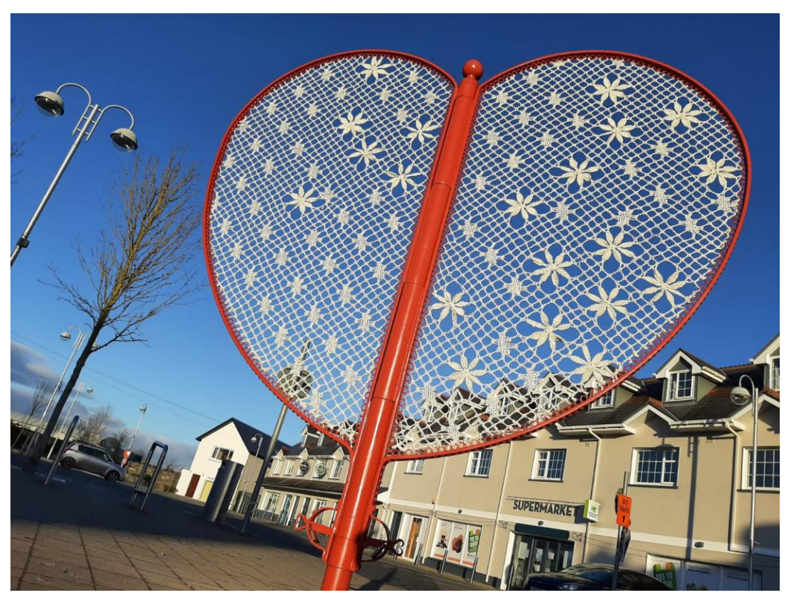
Lace Matrix in situ in St. George's Square, Headford