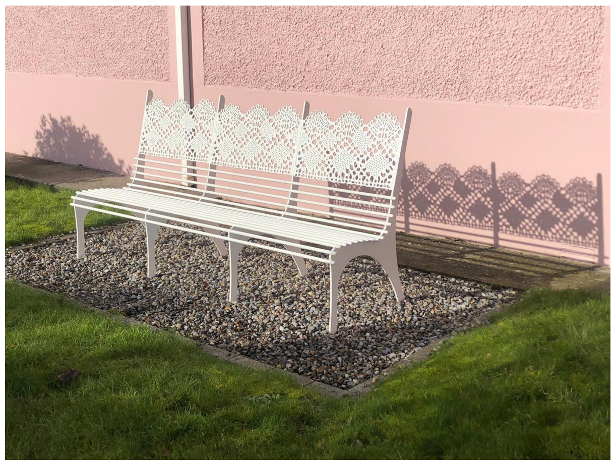
New DCCI-funded lace bench in front of Headford Library in St. Fursa's Hall, Headford